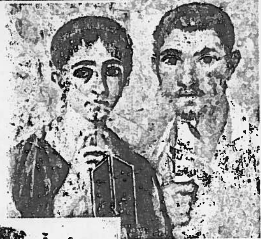
A young couple of ancient Rome