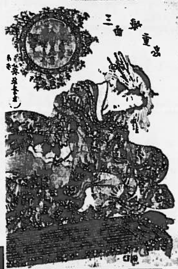
A woman of medieval Japan playing a musical instrument