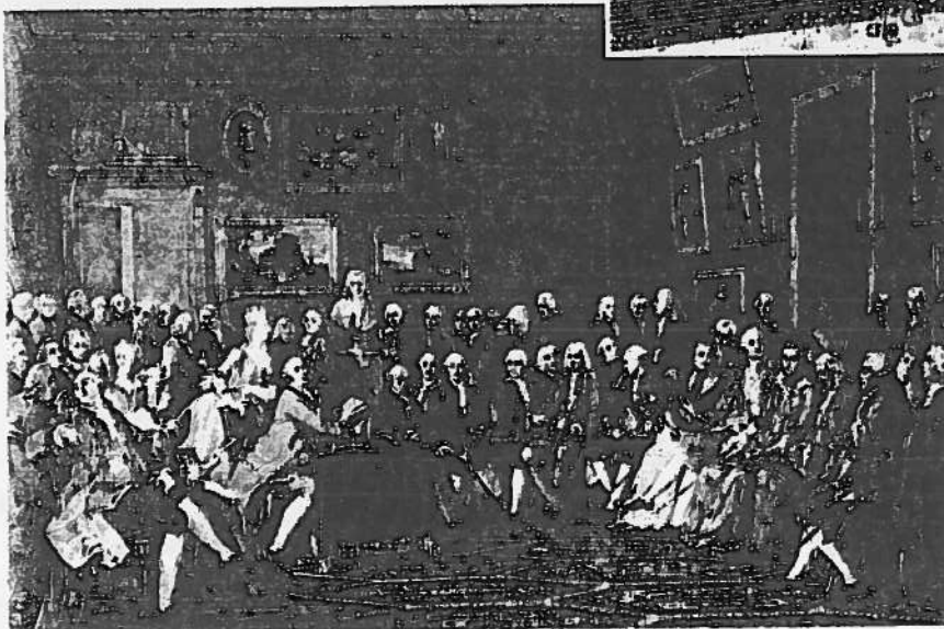
Educated Europeans of the early modern period discussing new ideas